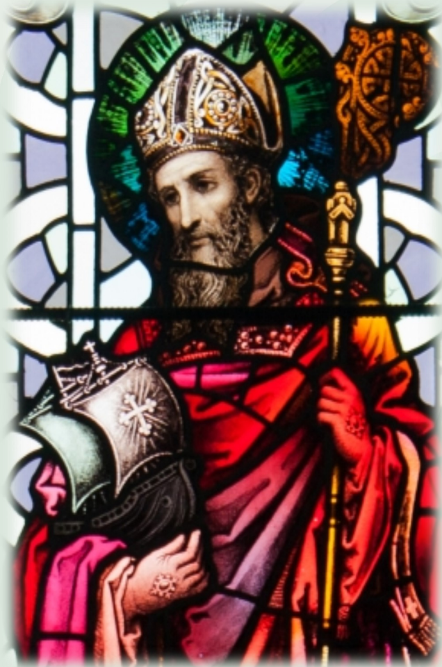
Stained Glass Window St. James, Glenleigh Kerry, Ireland

OCTOBER 26/27, 2019 30TH SUNDAY IN ORDINARY TIME