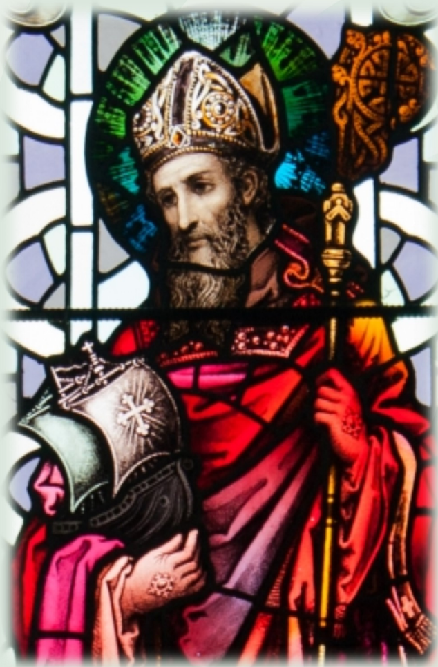
Stained Glass Window St. James, Glenleigh Kerry, Ireland

OCTOBER 26/27, 2019 30TH SUNDAY IN ORDINARY TIME