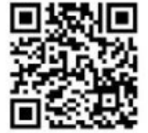
K of C OLG Novena