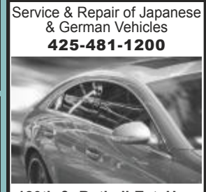
180th & Bothell-Evt. Hwy