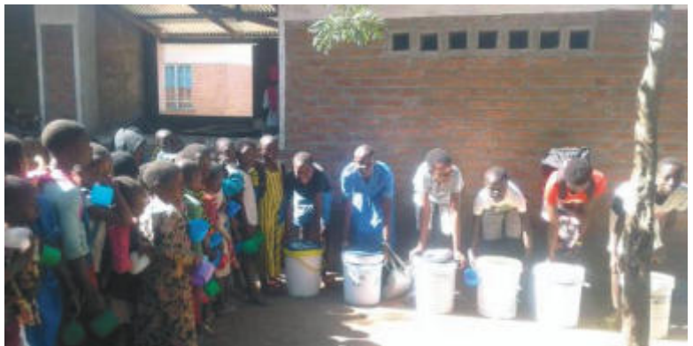
Mother Support Group serving porridge to learners at Lungwena Catholic Primary School.

We will also have a trip to Namalaka in August to visit our sister parish.