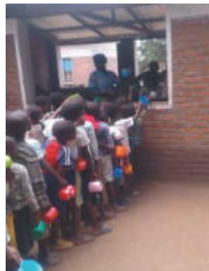
IMAGE: Lungwena Catholic Primary School Mothers Group serving porridge to learners.

The learners are back in school and are benefiting from the St. Brendan Bowl. They are excited every morning to receive their porridge.