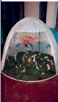
The Crib at Namalaka Parish