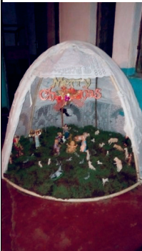
The Crib at Namalaka Parish