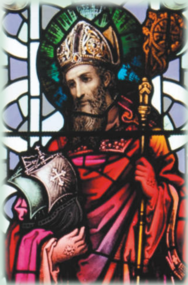
Stained Glass Window St. James, Glenleigh Kerry, Ireland

NOVEMBER 2/3, 2019 31ST SUNDAY IN ORDINARY TIME