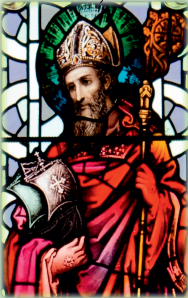
Stained Glass Window St. James, Glenleigh Kerry, Ireland

JULY 27/28, 2019 Seventeenth Sunday in Ordinary Time