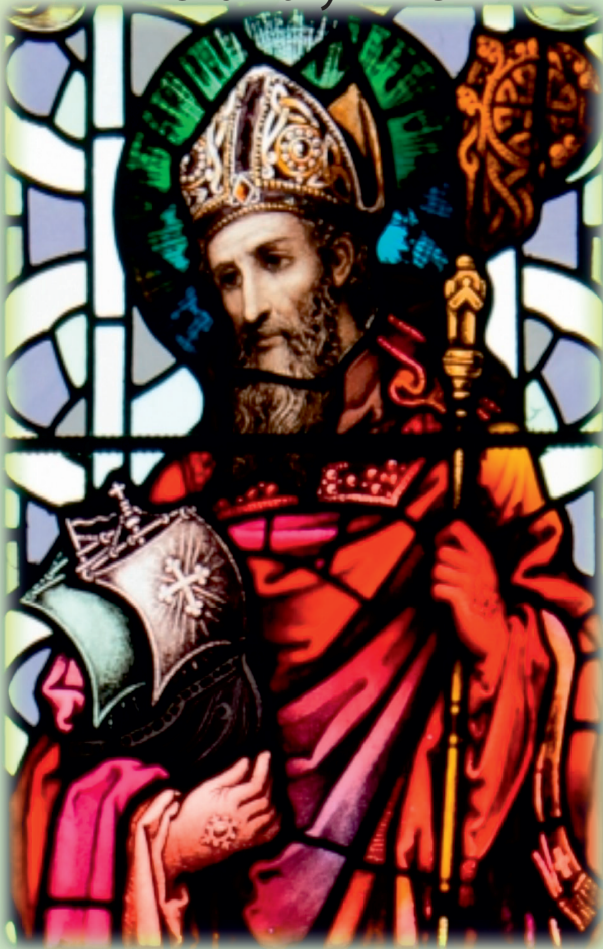
Stained Glass Window St. James, Glenleigh Kerry, Ireland

SEP 7/8 2019 Twenty-third Sunday in Ordinary Time