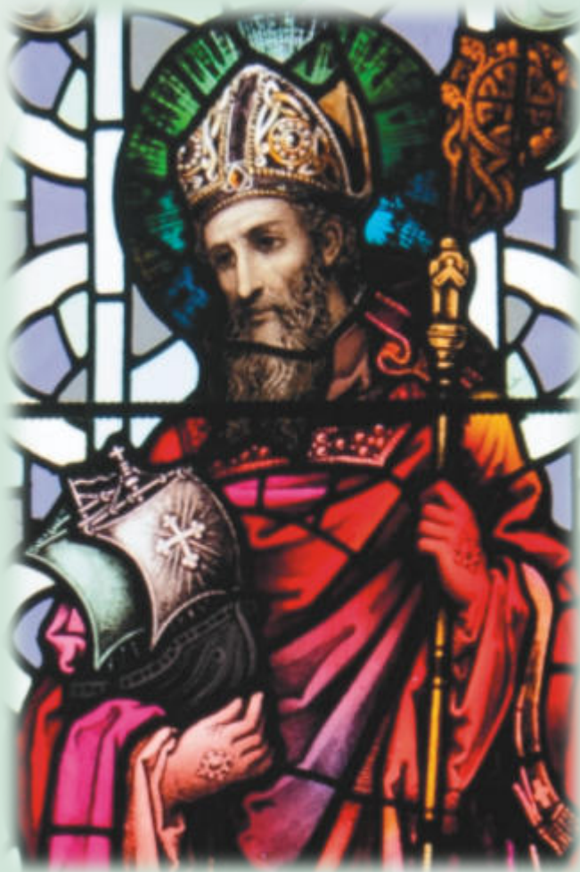
(Image above: St. Brendan) (Stained Glass Window St. James, Glenleigh Kerry, Ireland)