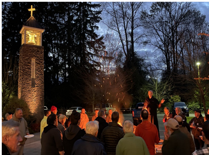
Men's Group Seafood Boil Saint Teresa – Oct. 17th WINTER 2025