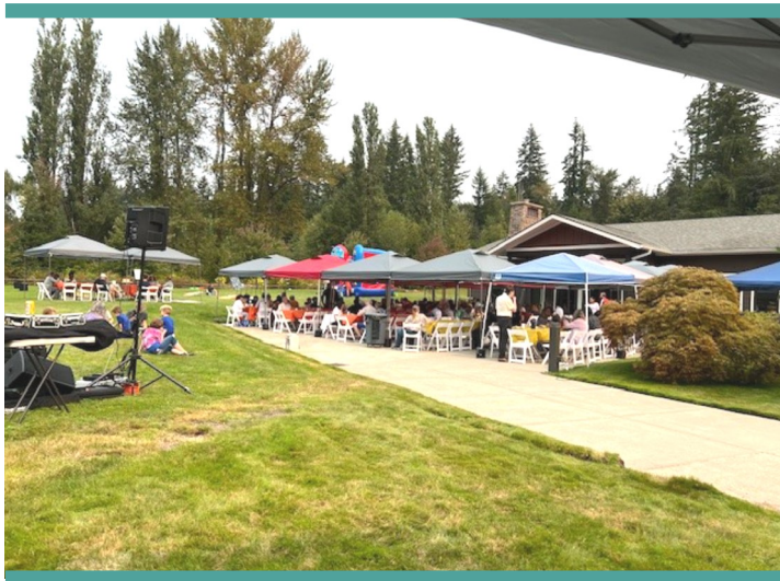
Saint Teresa Parish Picnic - September 8th