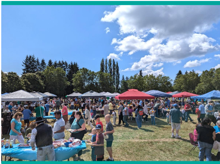
St. Brendan Parish & School Picnic - August 25th

Our Parish Family has had some great opportunities to gather in community, here are some highlights: