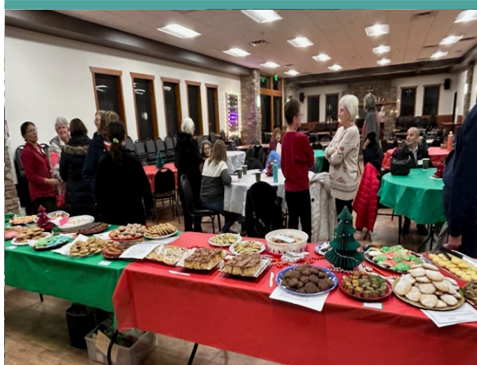
Women's Group Cookie Exchange – Dec. 16th