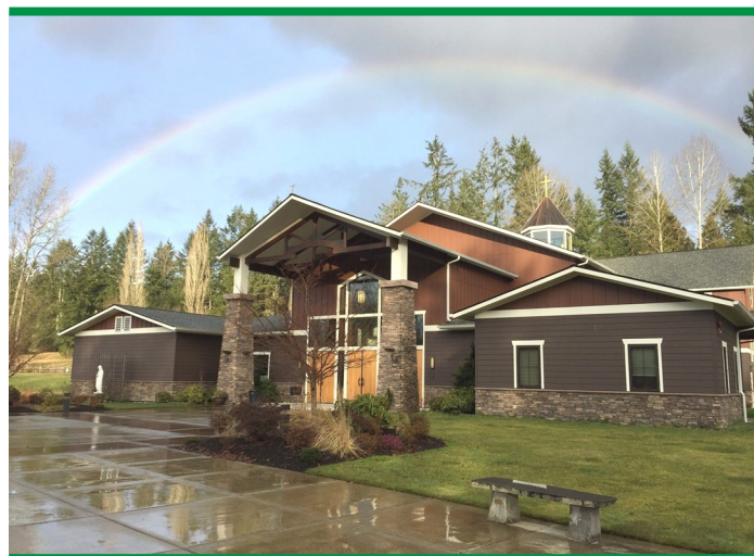
SAINT TERESA OF CALCUTTA WWW.SAINTTERESACALCUTTA.ORG