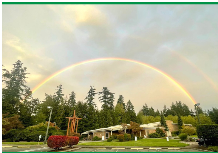
SAINT BRENDAN WWW.PARISH.SAINTBRENDAN.ORG