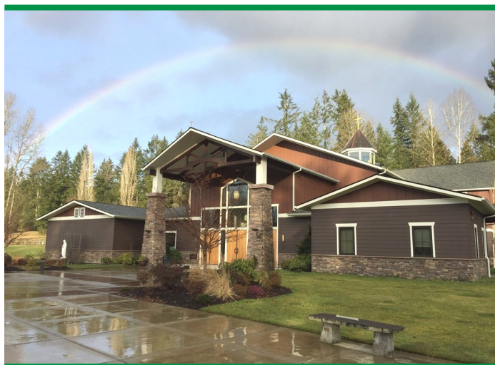
SAINT TERESA OF CALCUTTA WWW.SAINTTERESACALCUTTA.ORG